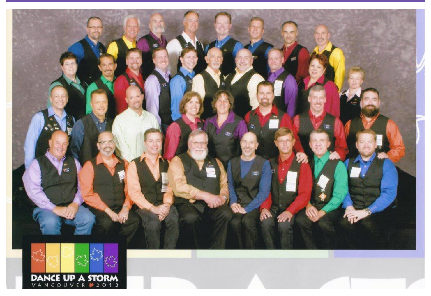
"Official" IAGSDC photo of the incredibly cute members of Hotlanta Squares at Dance Up a Storm, in Vancouver, B.C.