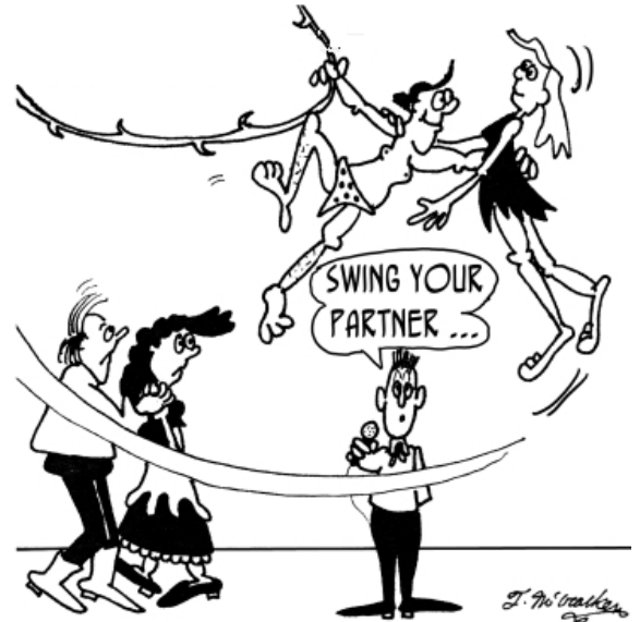
Tarzan & Jane Take Up Square Dancing

All Join Hands is an Associate member of the IAGSDC and sits on the Governing Board of ARTS (Alliance of Round, Traditional and Square-Dance Inc.)